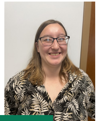
CLASS OF 2025